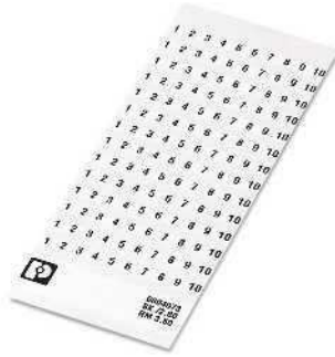
Markers labeled with 3.5 mm pitch