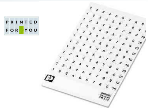
Markers labeled with 5.08 mm pitch