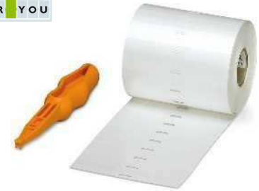
Markers for a terminal block width of 10.2 mm