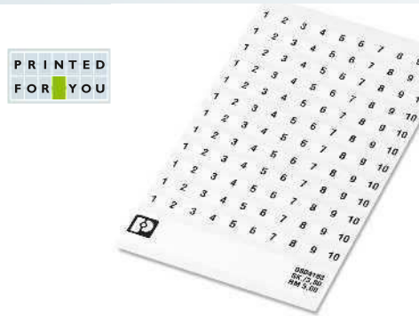
Markers labeled with 5 mm pitch

Notes: 1) For ordering example, see page 359.