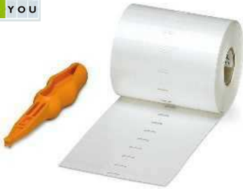
Markers with a strip width of 101.5 mm